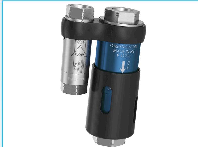
IB103-7SPSH-T - 3/8" Inline Breakaway with Vent Hose Breakaway

Inline breakaway designed for use in both public and private CNG refueling stations. Suitable for CNG, Hydrogen, Bio Gas, Nitrogen and Air.