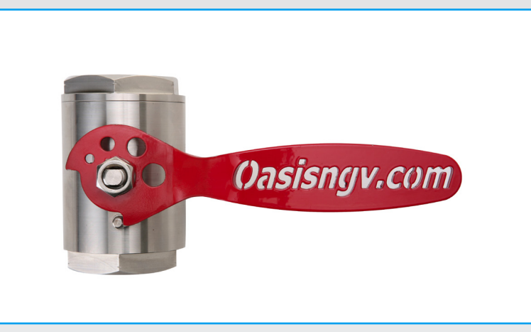
BV708-4N6LDDN-1000 - 1" Ball Valve

Suitable for use with CNG, Hydrogen, Helium, Bio-Gas, Nitrogen, Air and other gases on enquiry.