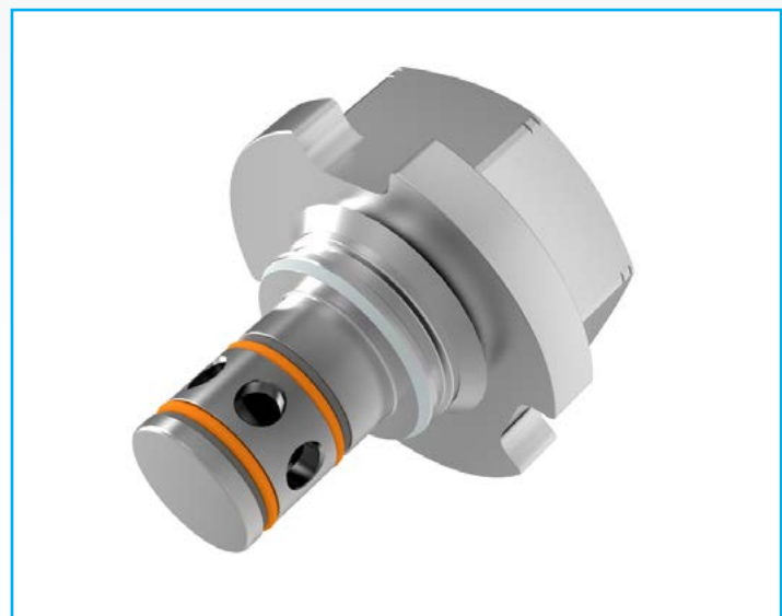
Male end replacement - IB108-ASDSS-M