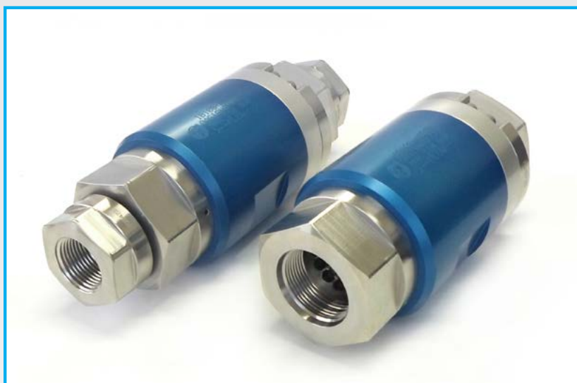
IB108 - Inline Trailer Breakaway

Suitable for CNG, RNG, Bio Gas, Nitrogen and Air.