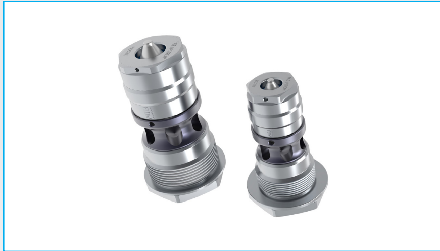
CC200 Series Cartridge Check Valves

Suitable for CNG, Bio Gas, Nitrogen and Air.